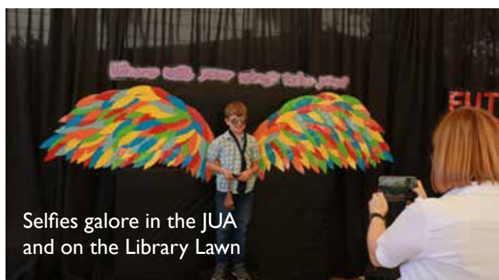
Selfies galore in the JUA and on the Library Lawn