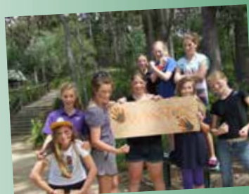
Survivor Day p7