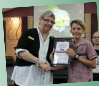
Time to Shine 2014 p5

58 Roberts Road, Beerwah Qld 4519 Ph: 07 5439 0033 Fax: 07 5439 0044 Email address: admin@gccc.qld.edu.au Web address: www.gccc.qld.edu.au Absentee line: 5436 5670