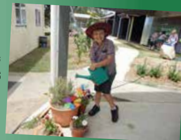
Kitchen Garden News p6