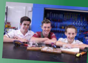
Legends of Speed... GCCC Drag Racing Champions p8