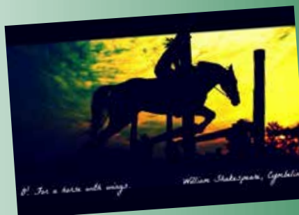
Writers and Riders p8