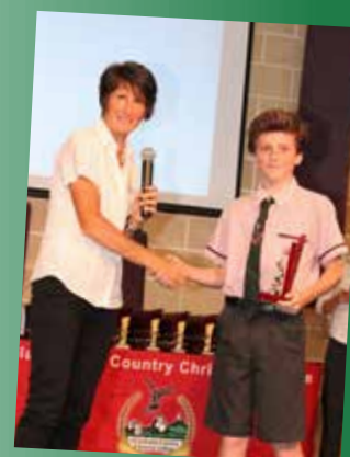
Sport Awards Night p10

GCCC is a ministry of Glasshouse Country Baptist Church